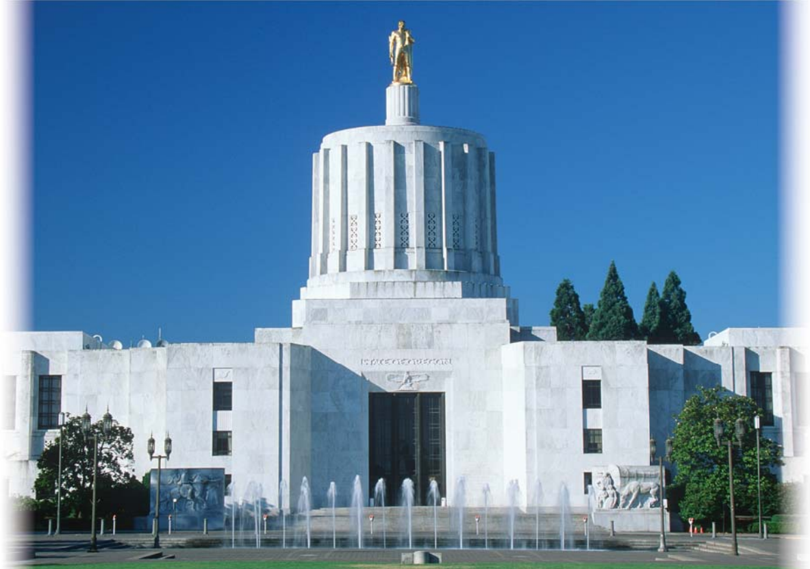
The State Capitol of Oregon, Salem

700 Summer St NE Salem Information .....800-828-8801 Benefit Claims.....800-692-9666 WORKERS' COMPENSATION BOARD 365 N 4th St Coos Bay .....541-267-3749 Workers' Compensation Division..800-452-0288 WORKSOURCE OREGON EMPLOYMENT DEPT Business & Recruitment Services Job Referral Services Brookings Ofc 16261 Hwy 101 Ste 11 .....541-469-9836 Or .....800-892-6347 Coos Bay North Bend Ofc 2075 Sheridan Ave .....541-756-8459 YOUTH AUTHORITY 400 Virginia Ste 114 North Bend .....541-756-4290